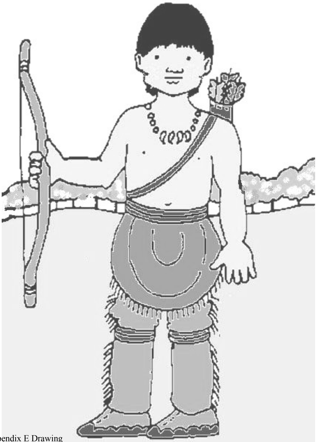
Appendix E Drawing