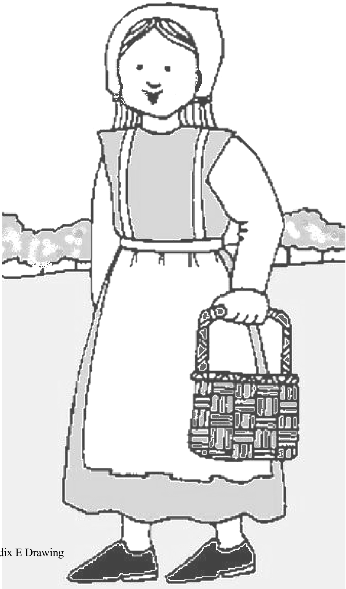
Appendix E Drawing